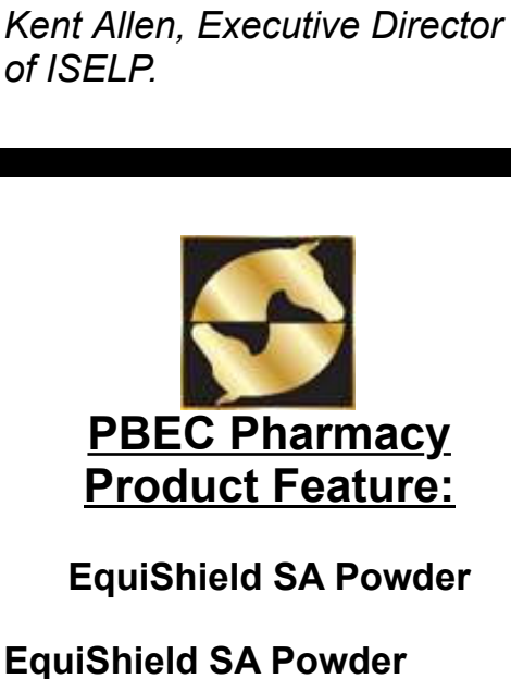
AAEP Avenues Internship/Externship Program.